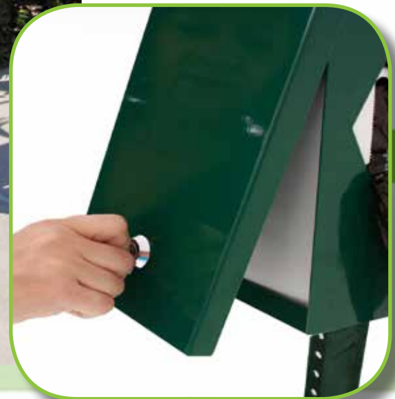
Locking Bag Dispenser

Standard Sign (included). Ask about custom sign graphics and pricing!