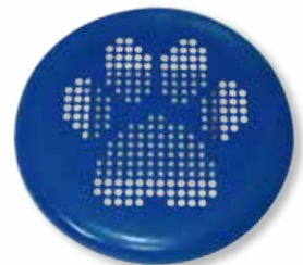
Stepping Surface Detail